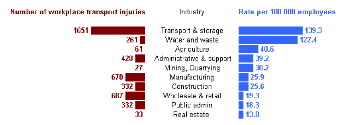
Figure 2 Numbers and rates of workplace transport injuries by industry, 2010/11 (RIDDOR)

The following chart shows the industries with the highest rates of workplace transport injury in 2010/11.